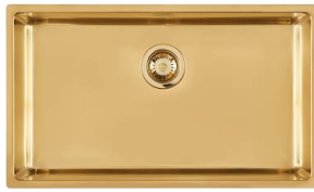
Sink KE Gold 2157 859